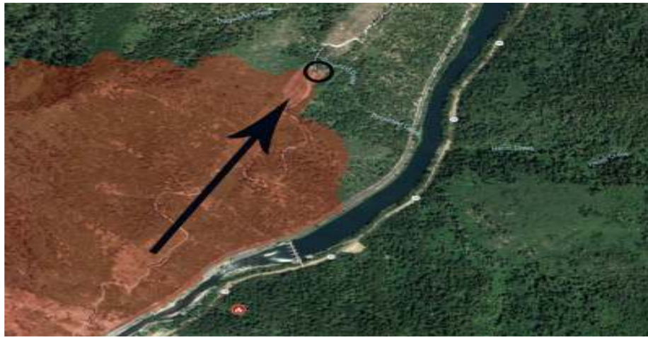
18 The Black Arrow Follows the Path of PG&E Transmission Lines with the 19 Black Circle Depicting the Suspected Area of Origin of the Camp Fire 14

6 139. Dispatch reports initially described the Camp Fire as a fire “under the high-tension 7 power lines” near the Feather River and Poe Dam. Firefighters arrived at the scene around 6:43 8 a.m. and confirmed that the fire was in fact located “underneath the transmission lines.”